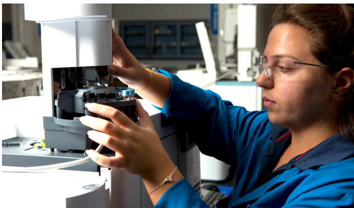
New globally standardized procedures, supported by proprietary QA/QC processes, ensure the delivery of the highest quality compositional data.