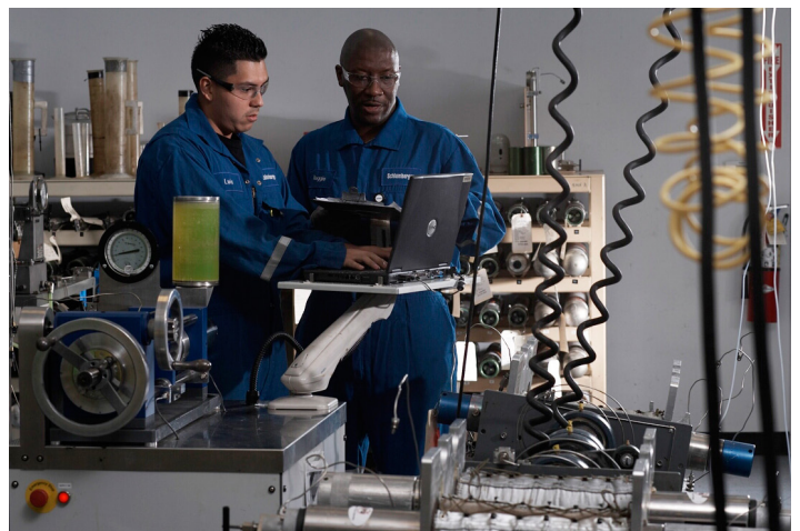
The state-of-the art Schlumberger Reservoir Laboratory in Houston delivers accurate PVT data through representative sampling and secure transfer and handling.