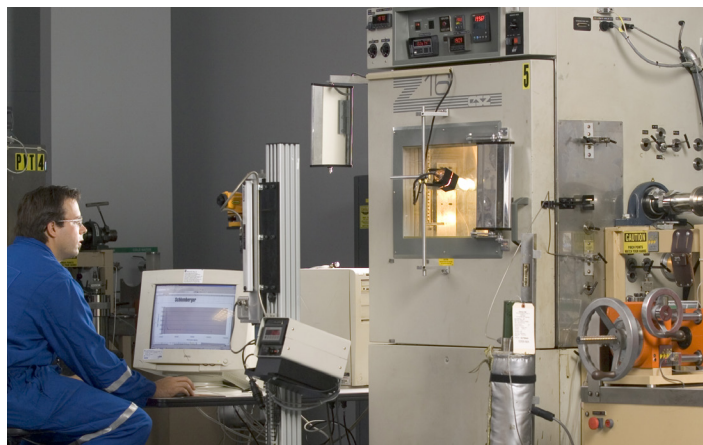
Mercury-free, visual PVT analysis systems manufactured by the Schlumberger DBR Technology Center in Edmonton, Canada, are at the heart of each fluid analysis operation performed at the Houston facility.

Close cooperation with a colocated Schlumberger Reservoir Laboratory in Houston that specializes in conventional core and digital rock analysis, enables further integration for complex reservoir solutions. Current and