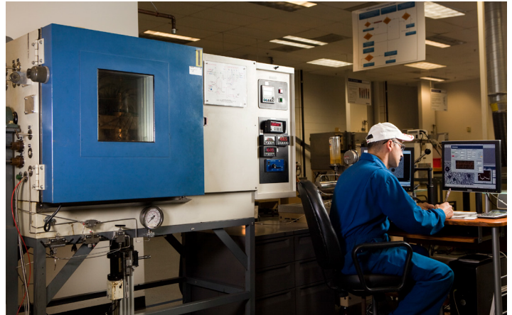
NIR solids detection supported by HPM became the industry-standard technique for assessing reservoir-fluid instability with respect to asphaltene precipitation.